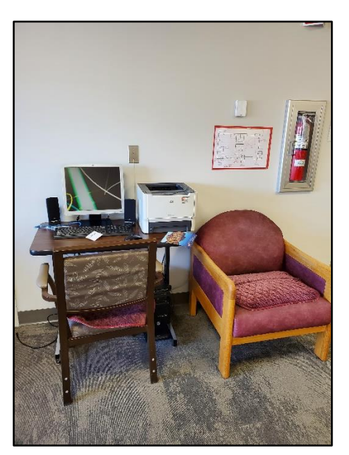
Computer area and chair