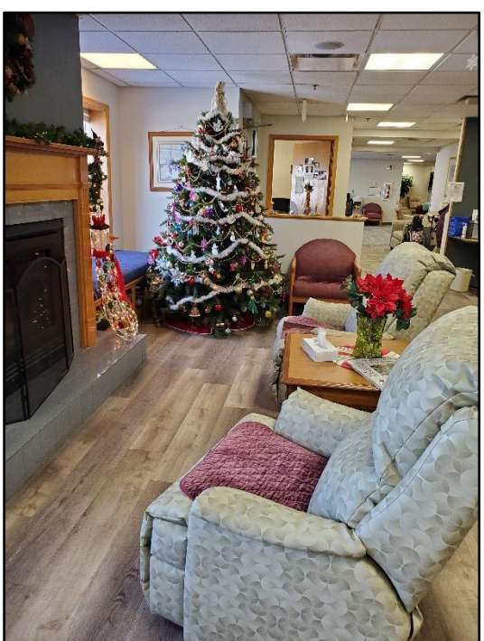
Seating area with seasonal decoration