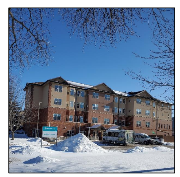
Benedictine Adult Day Center parking lot with exterior signage and campus bus and van