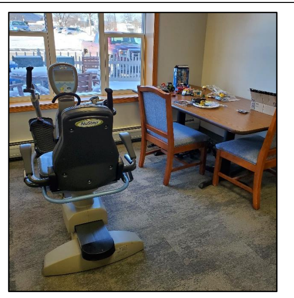
Recumbent exercise bike and games table