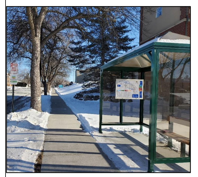
Public bus stop outside the setting