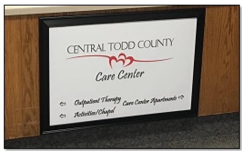
Interior signage for Care Center Apartments