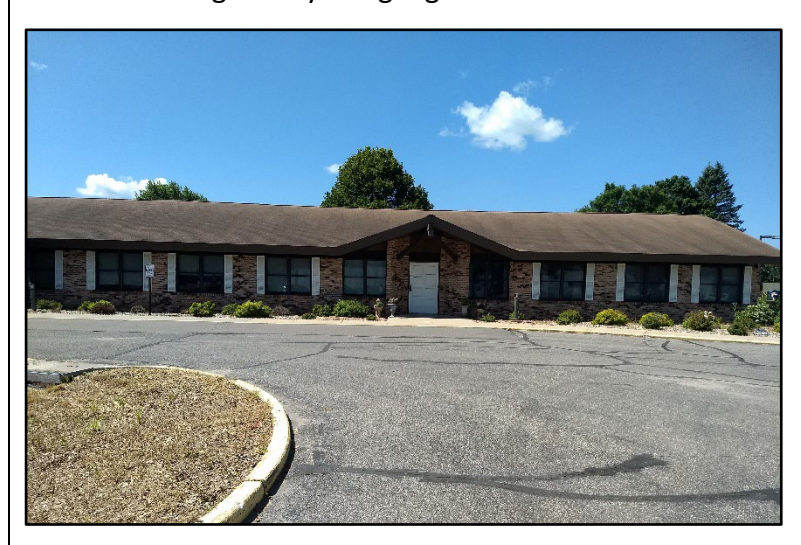
Building wing that contains the Care Center Apartments

In the photo below, the customized living setting is highlighted in yellow and the nursing facility is highlighted in red.