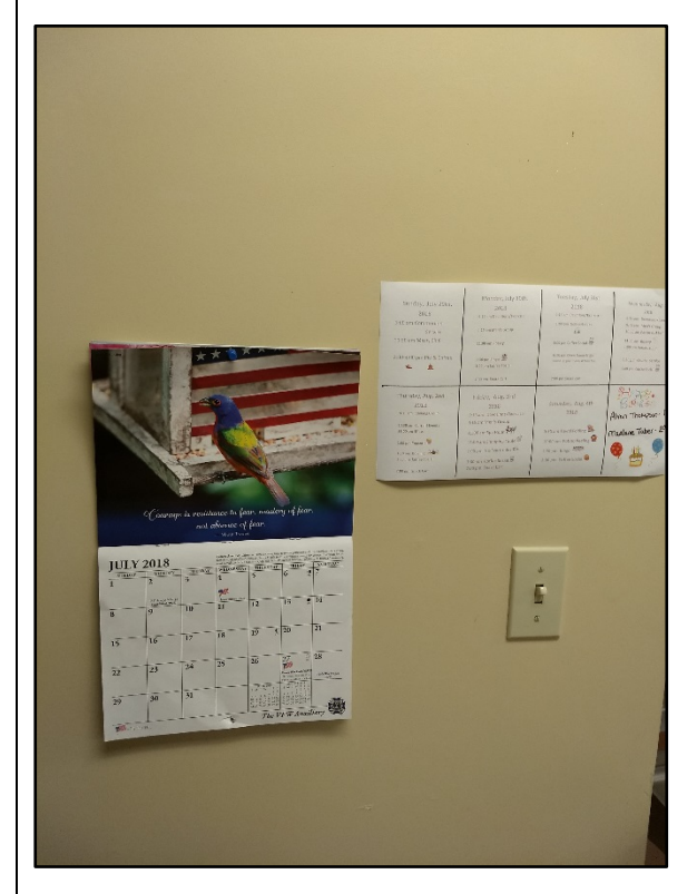
Monthly calendar and weekly activity calendar

Community engagement is formally supported by setting staff through setting activities and also more informally by family and friends from the greater community. The staff interviews residents to obtain their personal preferences, and supports the residents' choice in choosing their activities and schedules. Activities are tailored with feedback from people who live at the setting, through dedicated resident meetings, discussions with people, and by obtaining resident preferences during admission and at regular health assessments. Administration staff reported that a formal customized living resident council meets on a monthly basis, and that they incorporate suggestions from council representatives when planning residents' preferred activities.