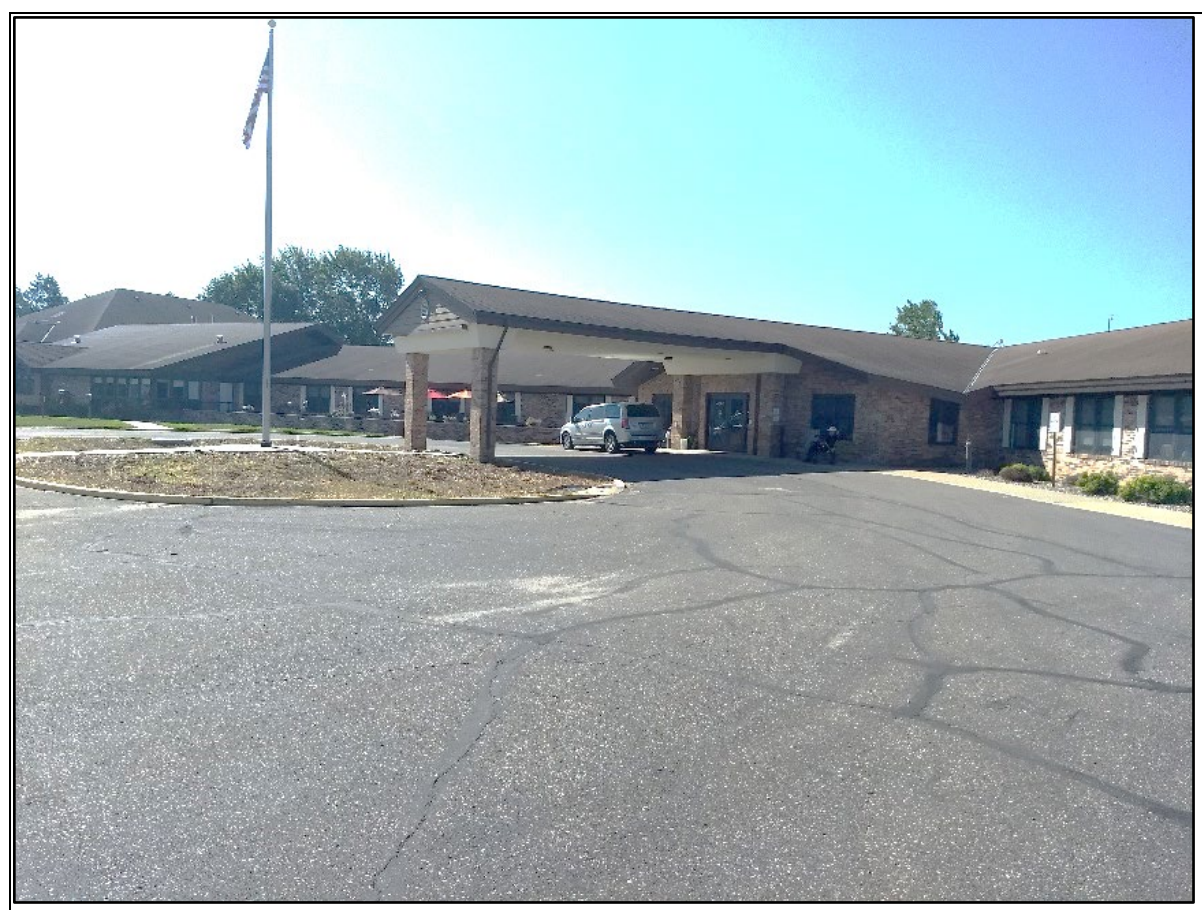
Front entrance to Care Center and Apartments