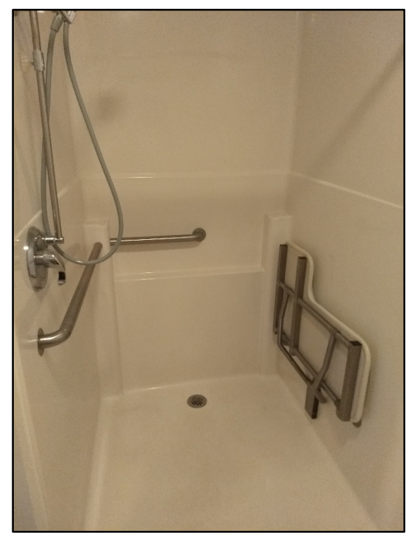
Shower with grab bars installed

Common spaces and living units were observed to be accessible to people living at the setting. People who live at the setting indicated that all living areas and common areas were accessible to them. Staff indicated that they work with people living at the setting to provide additional accessibility accommodations to living units, i.e., grab bars in bathrooms and living areas.