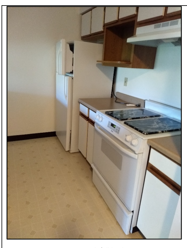
Living unit with full kitchen

Staff and people interviewed confirmed that people living at the setting have the freedom and support to control their own schedules, specifically waking up and going to bed, coming and going to and from the setting, and eating when they would like. Each living unit at the setting is equipped with a full kitchen and residents reported that they store and make food when they like. At the time of the site visit, one resident was reported to be "out for the summer with family."