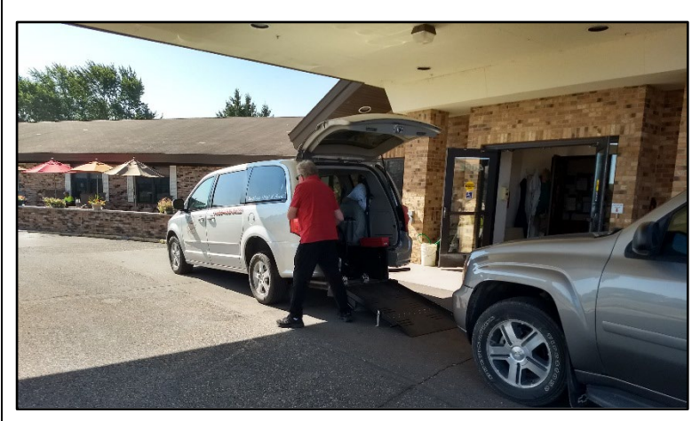
Transportation provider at front entrance

Participants in the setting in question do not have to rely primarily on transportation or other services provided by the facility setting, to the exclusion of other options.