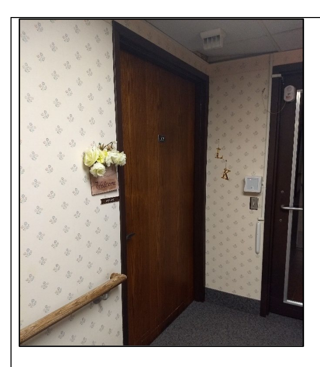
Personalized decorations outside living unit entrance

The lease allows people in the setting to decorate and personalize their living units. Living units were observed during the site visit and were decorated according to the person's taste and preference, including family pictures, religious icons, crafts and hobby items, and window and wall treatments. People also put up personalized decorations in the entrance to their living units.