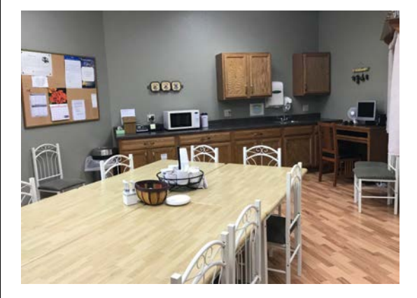
Common area kitchen