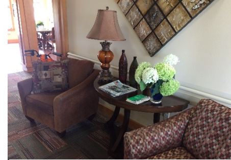
Sitting area in common area