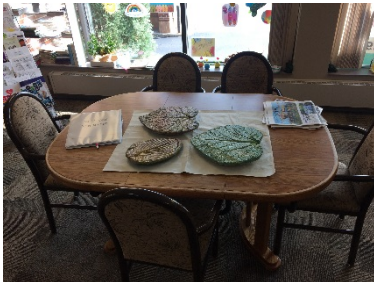
Activity table in common area