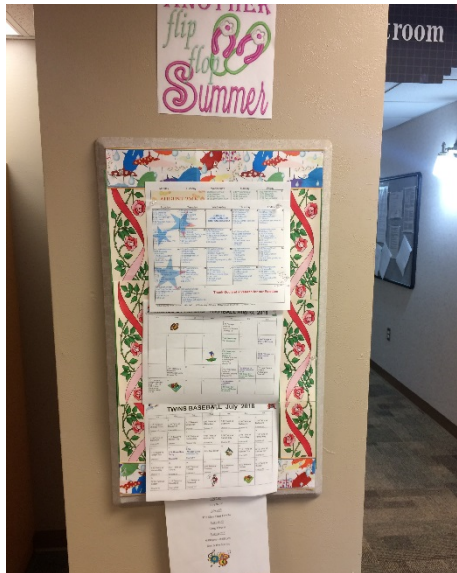
Monthly activity calendars

Activities will be participant driven. Participants, families, employees and volunteers will be actively involved in developing and carrying out life enrichment activities. Participants will always have the choice of participating, being an observer or not participating in an activity. Employees, participants and volunteers will collaborate to ensure that meaningful activities for each participant are honored.”