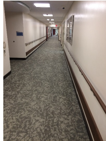
View of hallway (circled in yellow in aerial picture) that connects the Adult Day program to the Assisted Living program.