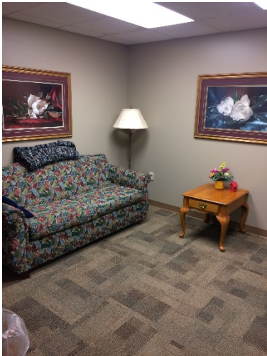
Separate room with couch for quiet area, as desired