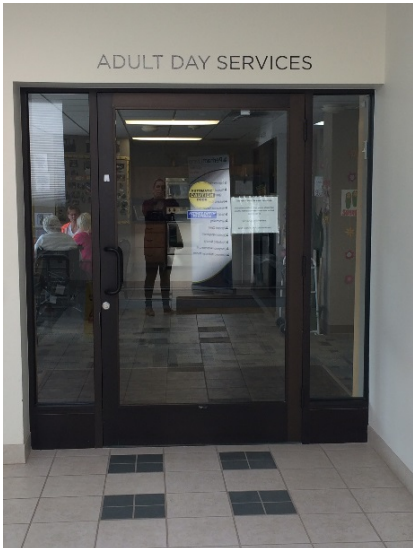
Perham Living Adult Day Service entrance