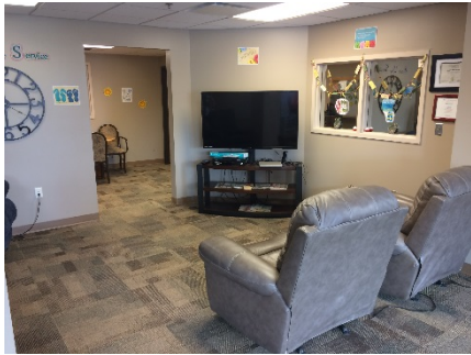
Visiting/sitting room in common area