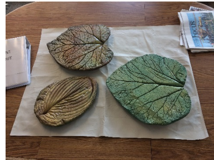
Leaf art project