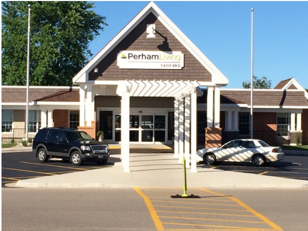
Perham Living nursing facility entrance/building