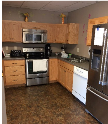
Kitchen in common area

A person interviewed also reported people in the program are able to have snacks any time they desire. There is a snack drawer with snacks that they can access at any time. The refrigerator in the common area has juice and soda available. Coffee is available in the kitchen area.