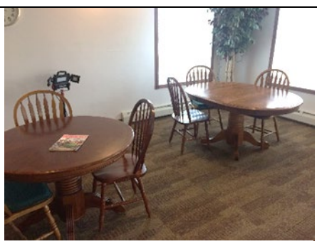
Common sitting area