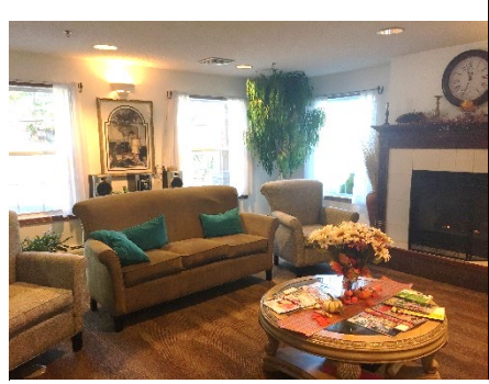
Common sitting area