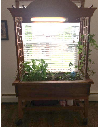
Indoor flower garden