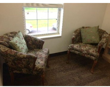
Common sitting area