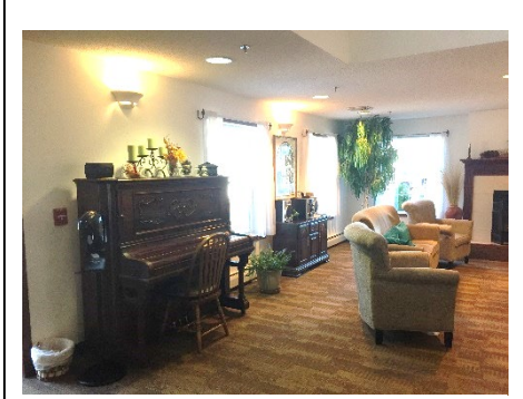
Common sitting area