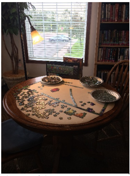
Jigsaw puzzle in progress in common area