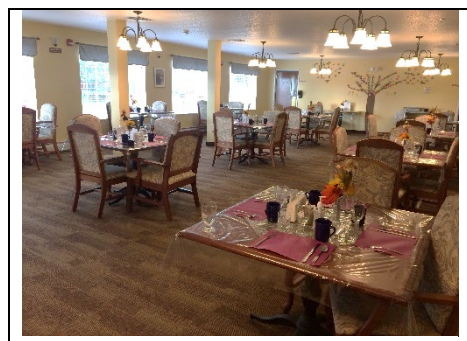
Dining room where people choose seating