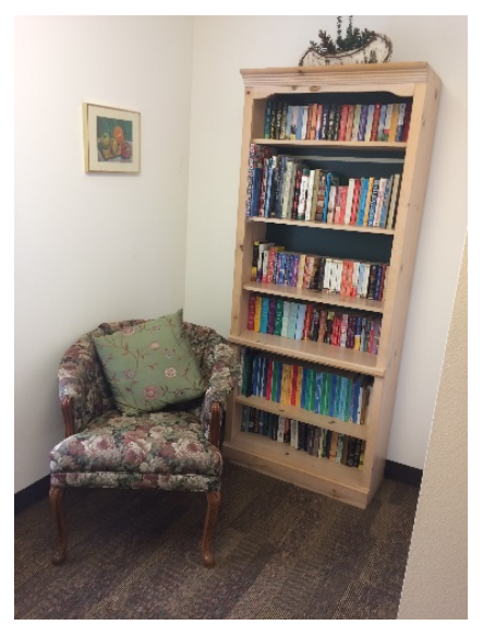
Book shelf for residents to read