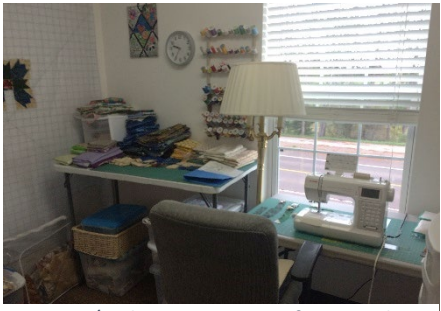
Sewing/quilting area set up for a resident that enjoys quilting