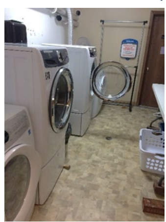
Laundry room open for use by residents