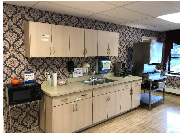
Community kitchen area with snacks and drinks