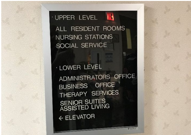
Lower level of building is assisted living. Upper level is nursing facility.