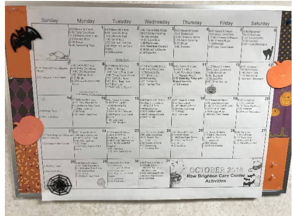
Setting bulletin board and activity calendar