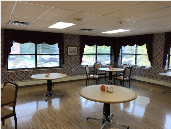
Dining area and large group activity space