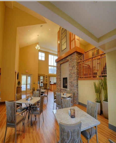
One of the dining areas