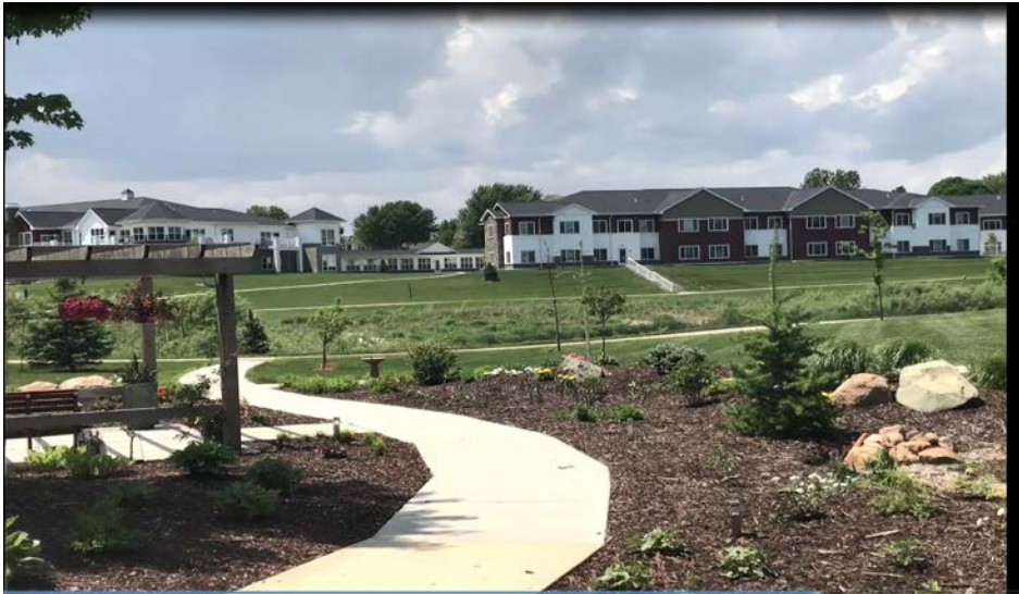
The garden area