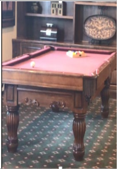
The Club Room