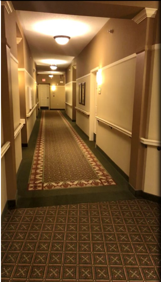
Hallway to the customized living