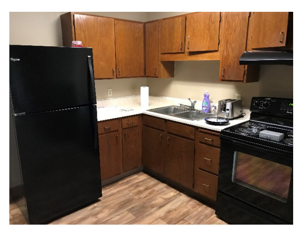
Standard living unit kitchen