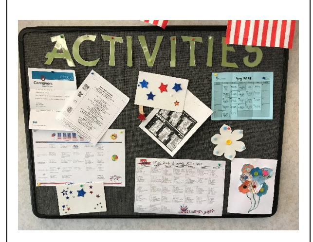
Community activity bulletin board