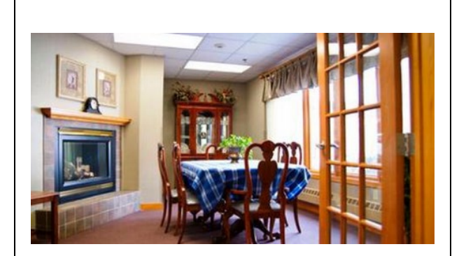
Common space in the setting