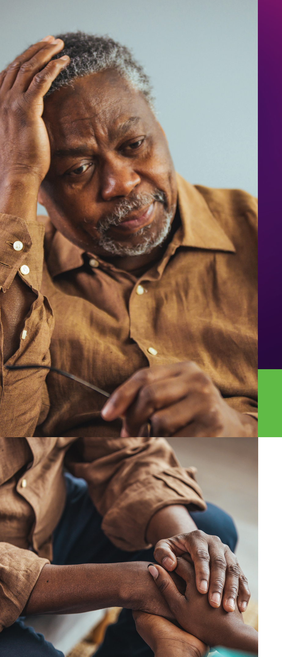
Maltreatment has many forms: