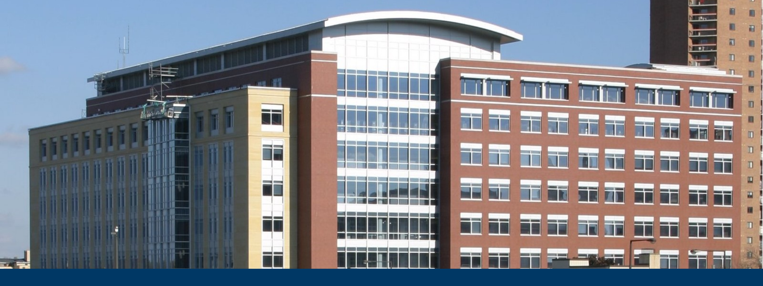
DHS' Role in the Legislative Process