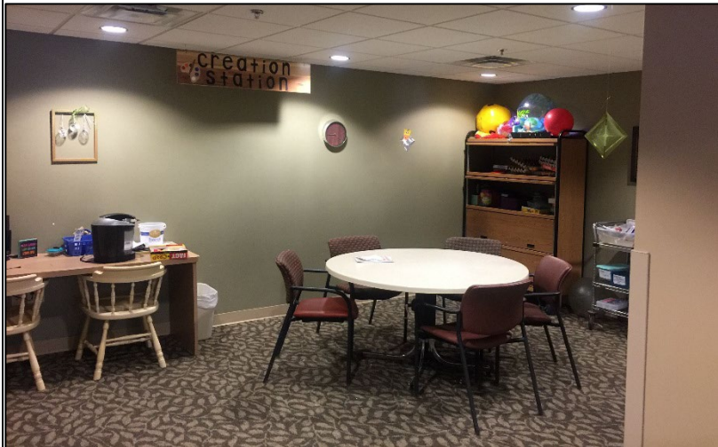
Creation Station – activity area