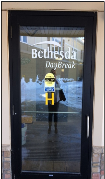
DayBreak entrance door