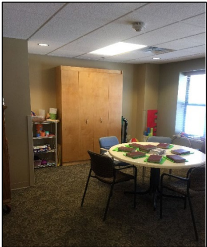
Separate activity area