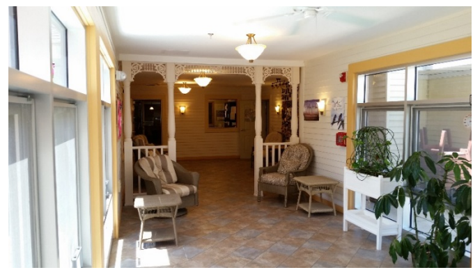
Sign outside of the campus