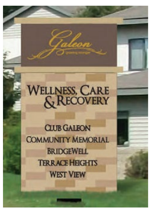
Sign outside of campus