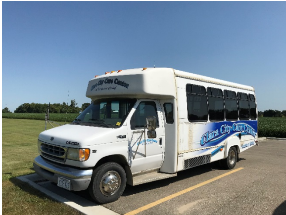
The setting's accessible van