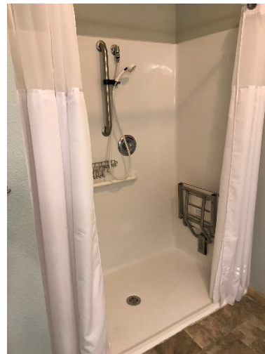
Accessible features in living units