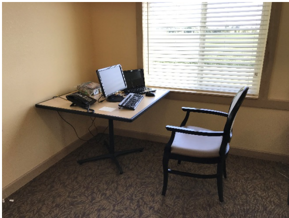
Computer available to people in the setting, in a common area