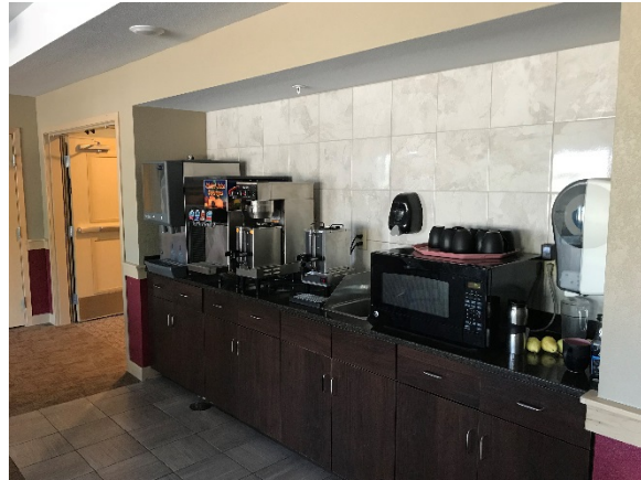
Common kitchen and dining area with food and drink available throughout the day