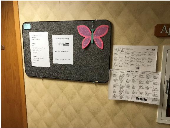
Activity bulletin board