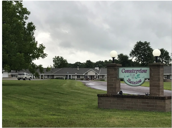
Separate driveway and building signage