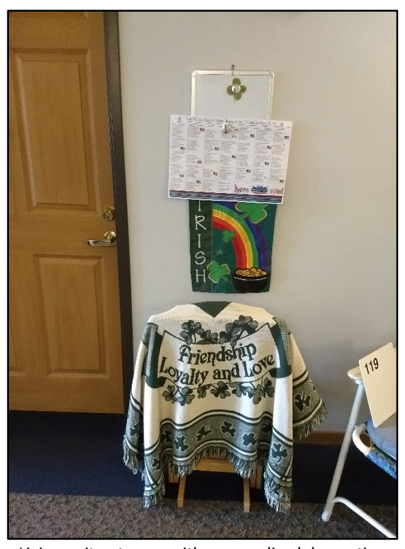
Living unit entrance with personalized decoration and lock on door

The lease allows people in the setting to decorate and personalize their living units. Living units were observed during the site visit and were decorated according to the person's taste and preference. Many people also put up personalized decorations in the entrance to their living units. People at the setting confirmed that they can furnish and decorate their living units as they wish.