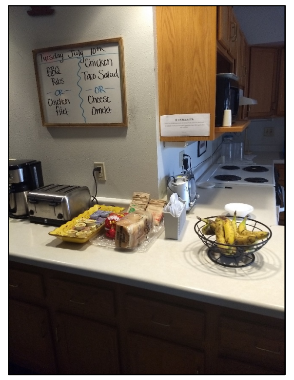
Kitchen area with fresh fruit and snacks