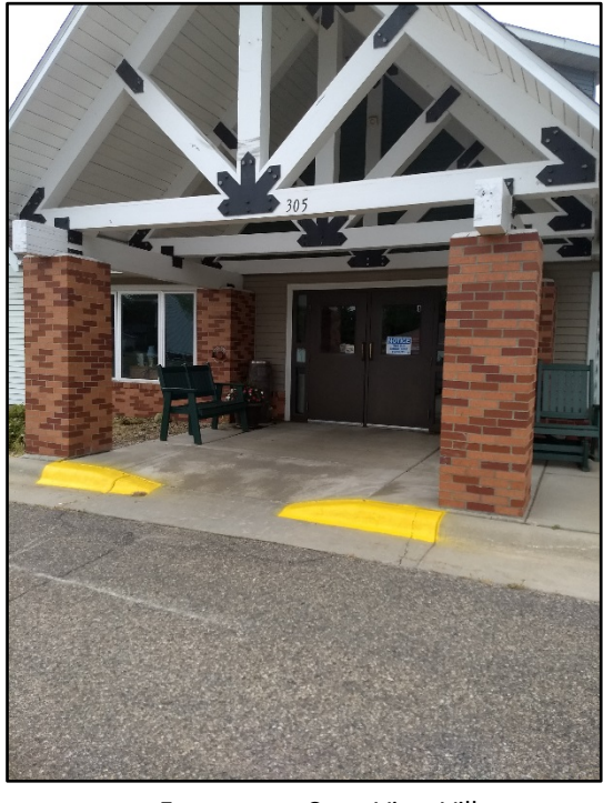
Entrance to Crest View Villa

Crest View Villa is located in a rural area with limited public transportation. There is a public regional bus that runs on a limited schedule to Rochester, MN, the nearest metropolitan area. The public bus leaves from the central business district in Hayfield. People at the setting also use the setting's van, which is accessible to people with mobility needs, for trips into town. People at the setting also utilize family transports, volunteer driver services, Faith-in-Action services and their own vehicles for transportation needs.