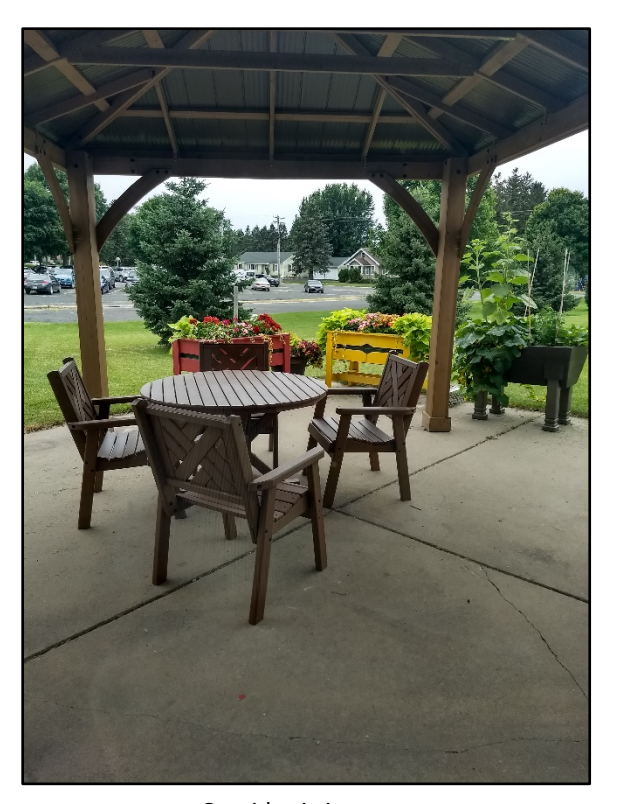
Outside sitting area