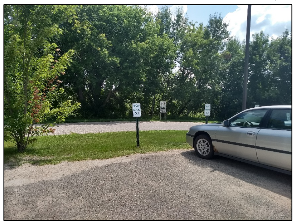
Resident parking area with signage and residents' cars