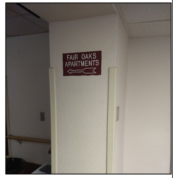
Interior signage directing to Fair Oaks Lodge Apartments

Fair Oaks Lodge Apartments provides services in a space that is distinct from the space used by the nursing facility. Customized Living services are provided in a separate building of the larger complex, connected via an indoor walkway with inside signage indicating the separation. The setting has a separate outside entrance from the other settings. In the picture below, the Fair Oaks Lodge Apartments is outlined in yellow, and Fair Oaks Lodge Nursing Home is outlined in red.