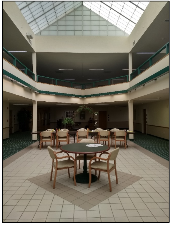
Community and dining area in Atrium of Fair Oaks Lodge Apartments