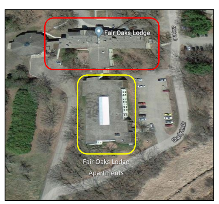
Aerial view of Fair Oaks Lodge campus