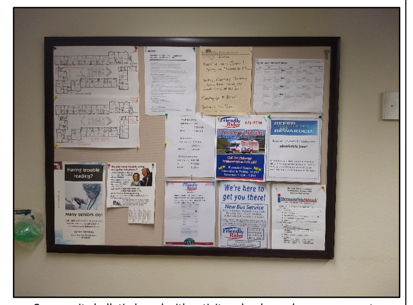
Community bulletin board with activity calendar and announcements

The setting provides an activity calendar for people to participate in at the setting which also includes activities taking place in the nursing facility. People are also informed of on-site activities through bulletin board announcements and staff announcements and reminders.