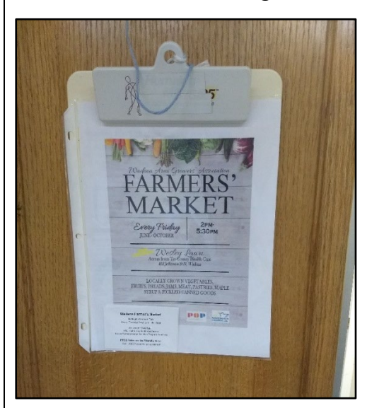
Farmers' market announcement posted on wall

The setting supports opportunities to access and engage in community life. Practical activities, such as errands and medical appointments are supported, as well as personal engagement, such as social and family outings, faith-based activities, and meals in the community.