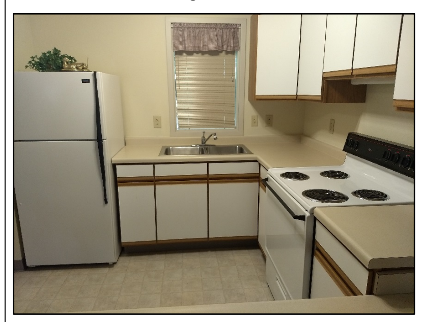
Full kitchen in living unit

Staff and residents confirmed that people living at the setting have the freedom and support to control their own schedules, specifically waking up and going to bed, coming and going to and from the setting, and eating when they would like. Each living unit at the setting is equipped with a full kitchen and residents reported that they store food in their pantry and refrigerator.