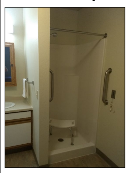
Accessibility accommodations in bathroom

Common spaces and living units were observed to be accessible to people living at the setting. People who live at the setting indicated that all living areas and common areas were accessible to them. Staff indicated that they accommodate people living at the setting to provide additional accessibility accommodations to living units, i.e., grab bars in bathrooms and living areas.