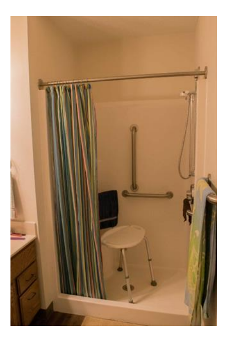
Accessible features in living unit bathrooms

Events at the setting open to the wider public