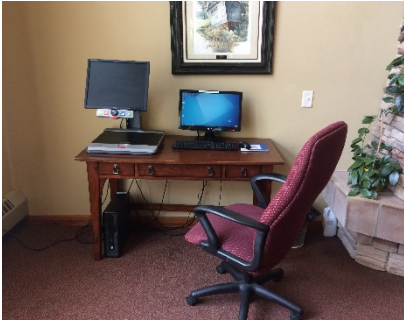
Computer with internet in common area