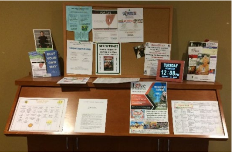
Bulletin board and announcements

Setting's Activities and Community Life policy states, "Lakeview Retirement Residence will provide, based on the assessment and care plan and the preferences of each tenant, an ongoing program to support tenants in their choice of activities, both facility-sponsored group and individual activities and independent activities, designed to meet the interests of and support the physical, mental, and psychosocial well-being of each tenant, encouraging both independence and interaction in the community."