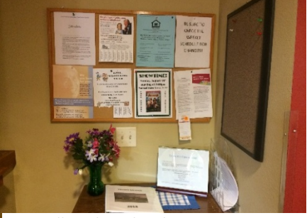
Bulletin board and announcements