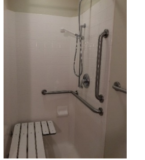
Accessible shower in apartment