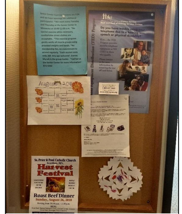
Community bulletin board with activity calendar and announcements

The setting provides an activity program for people to participate in at the setting, which also includes activities taking place in the nursing facility. People are informed of on-site activities through bulletin board announcements and staff announcements and reminders.