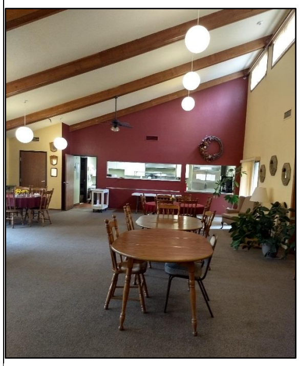
Dedicated dining area and community room