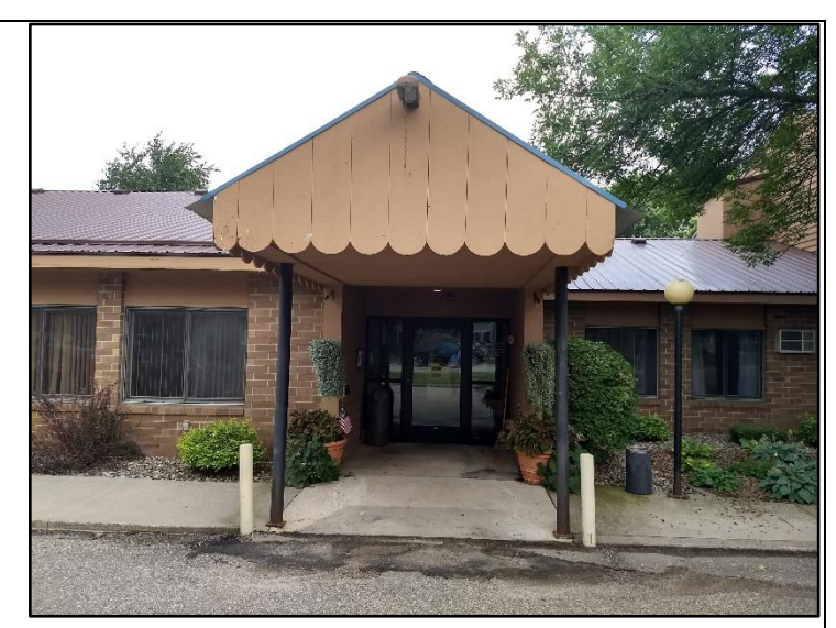
Front entrance to Madison Avenue Apartments

Madison Avenue Apartments provides services in a space that is distinct from the space used by the nursing facility. Customized living services are provided in a separate building of the larger complex, connected via an