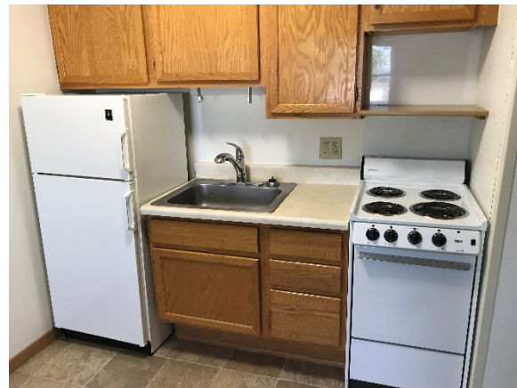
Standard living unit kitchen