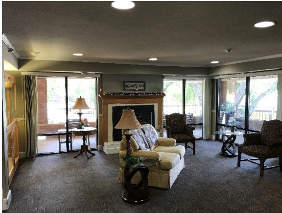
Common space lounge area and view of front porch