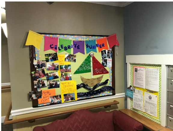
Bulletin board advertising on- and off-site activities