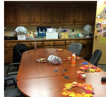
Crafts being made in activities room