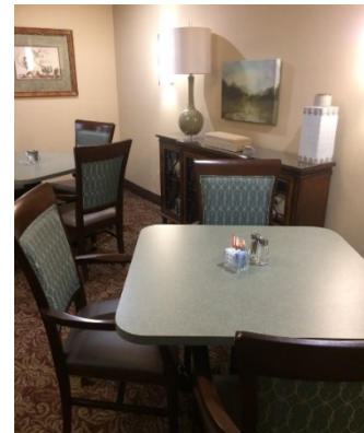
Dining room where people choose seating