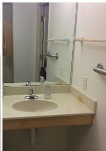
Wheelchair accessible sink