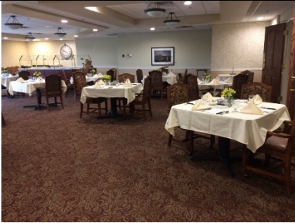
Dining room where people choose seating