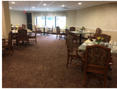
Dining room where people choose seating