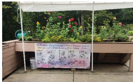
Raised flower garden for accessibility