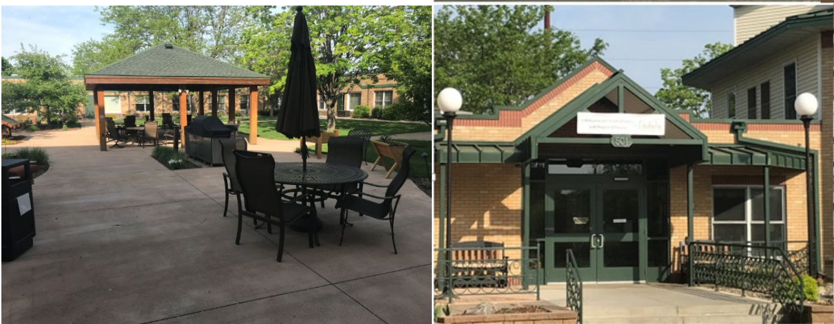
Patio view and a photo of the front entrance