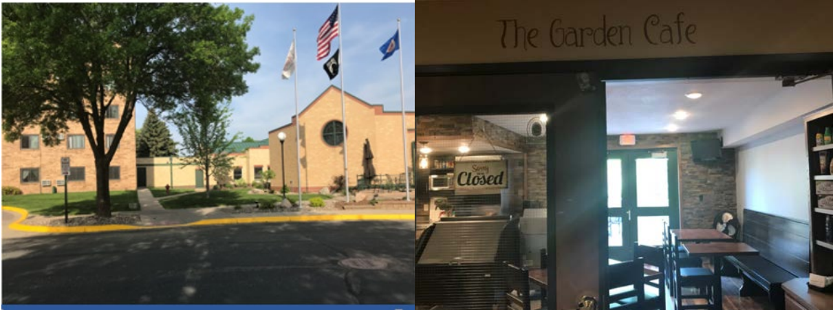
The exterior of the building and the Cafe