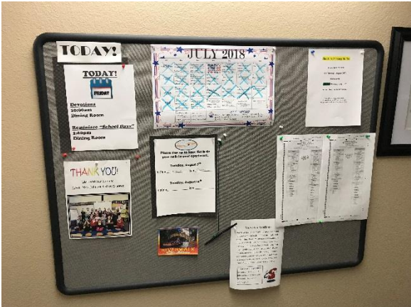
Community activity bulletin board