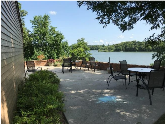
Outdoor space in the setting