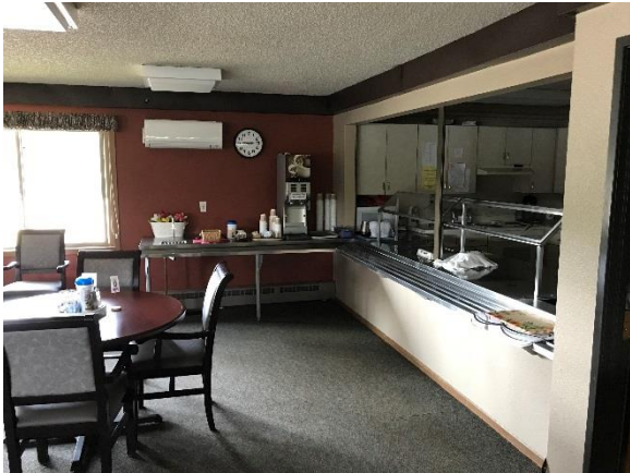
Dining area with food and beverage options between meals