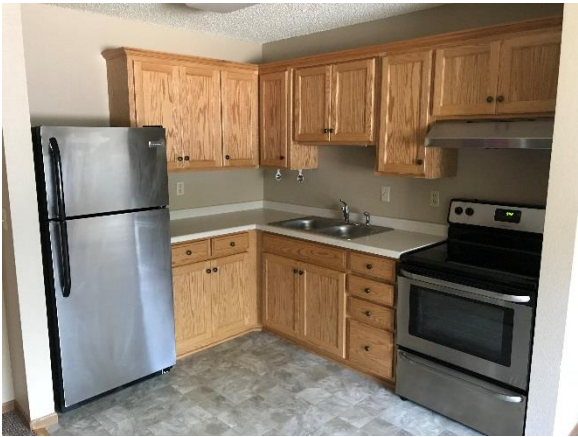
Standard living unit kitchen