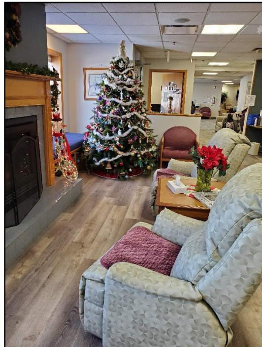
Seating area with seasonal decoration