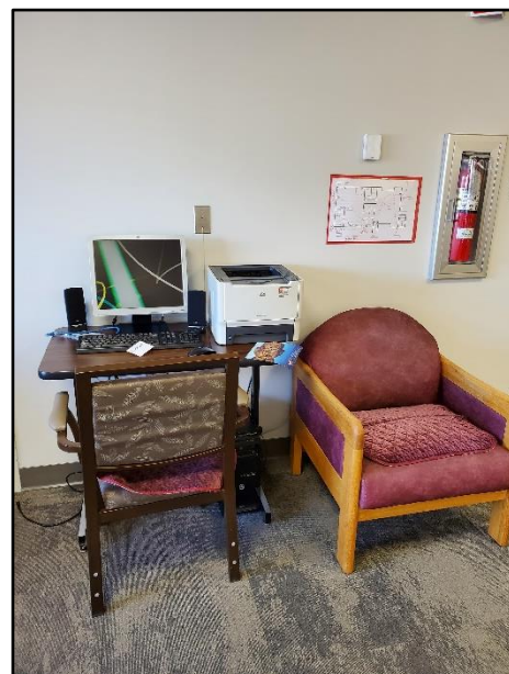
Computer area and chair