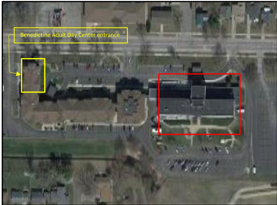
Aerial view of Benedictine Adult Day Center, which is highlighted in yellow (smaller rectangle at left), and Benedictine Saint Anne, outlined in red (larger rectangle at right)