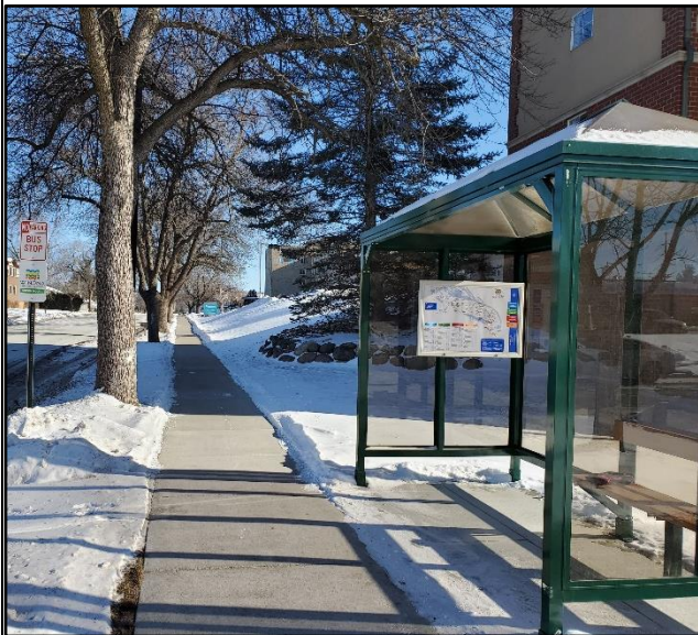
Public bus stop outside the setting