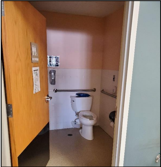
Accessible private bathroom with lockable door