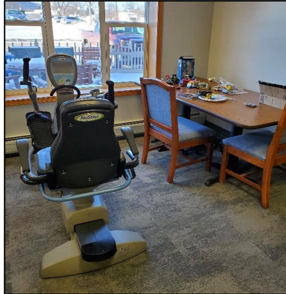
Recumbent exercise bike and games table