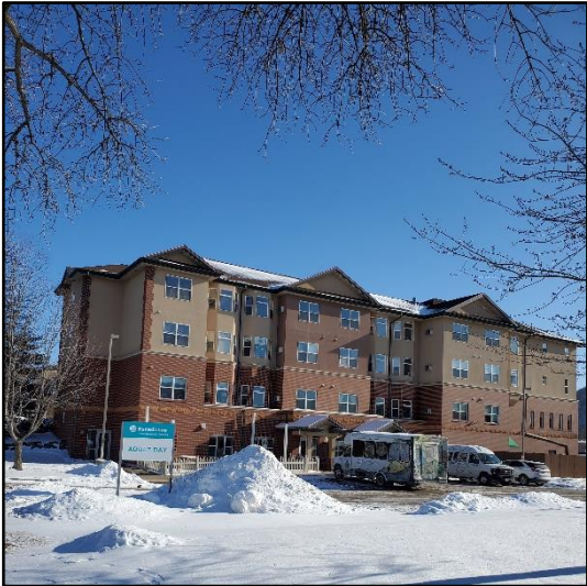
Benedictine Adult Day Center parking lot with exterior signage and campus bus and van