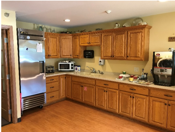
Dining area with food and beverage options between meals