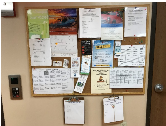
Community activity bulletin board, including sign-up sheets for rides to area amenities