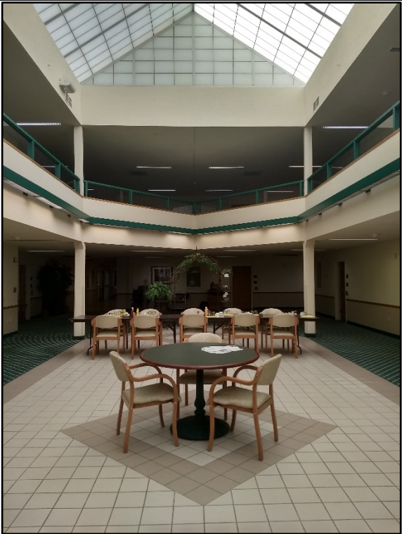
Community and dining area in Atrium of Fair Oaks Lodge Apartments