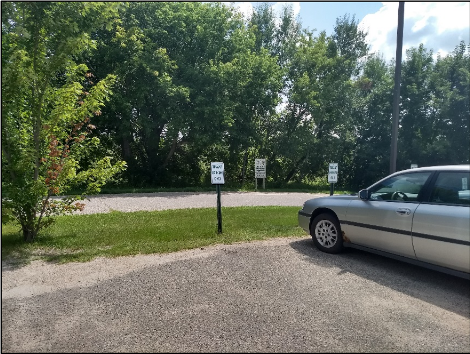
Resident parking area with signage and residents' cars