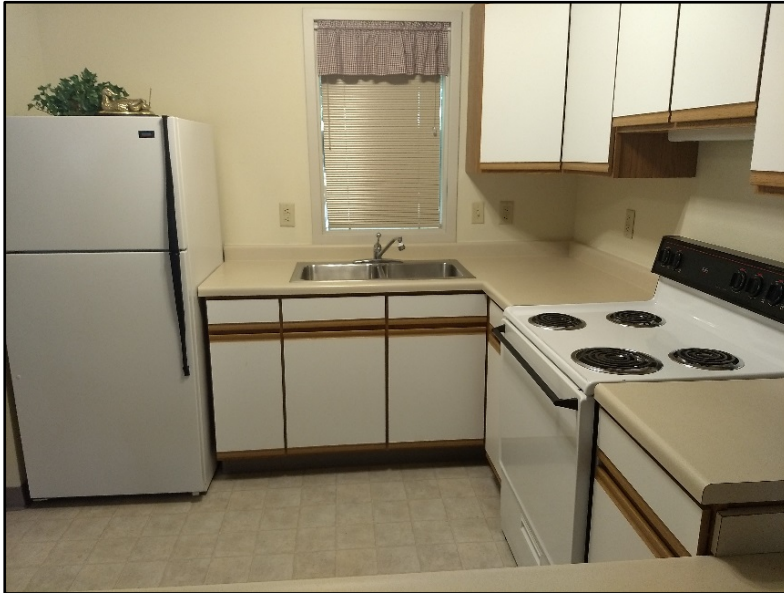
Full kitchen in living unit

Staff and residents confirmed that people living at the setting have the freedom and support to control their own schedules, specifically waking up and going to bed, coming and going to and from the setting, and eating when they would like. Each living unit at the setting is equipped with a full kitchen and residents reported that they store food in their pantry and refrigerator.