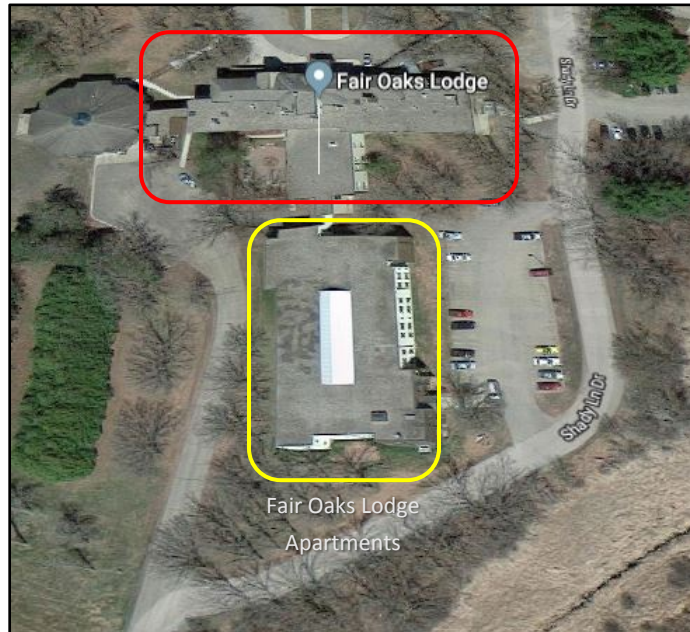
Aerial view of Fair Oaks Lodge campus