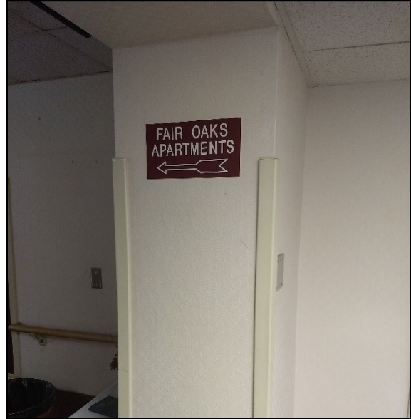
Interior signage directing to Fair Oaks Lodge Apartments

Fair Oaks Lodge Apartments provides services in a space that is distinct from the space used by the nursing facility. Customized Living services are provided in a separate building of the larger complex, connected via an indoor walkway with inside signage indicating the separation. The setting has a separate outside entrance from the other settings. In the picture below, the Fair Oaks Lodge Apartments is outlined in yellow, and Fair Oaks Lodge Nursing Home is outlined in red.