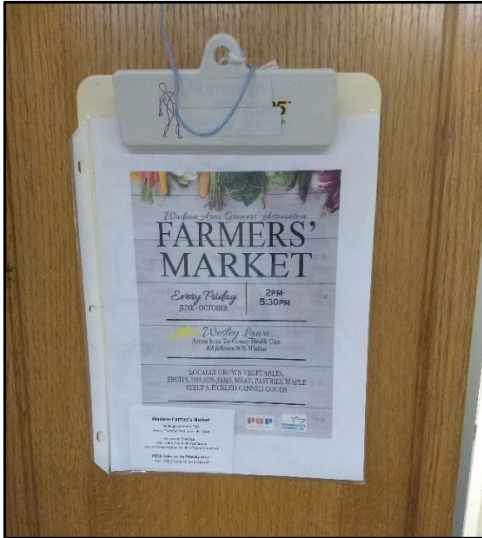
Farmers' market announcement posted on wall

The setting supports opportunities to access and engage in community life. Practical activities, such as errands and medical appointments are supported, as well as personal engagement, such as social and family outings, faith-based activities, and meals in the community.