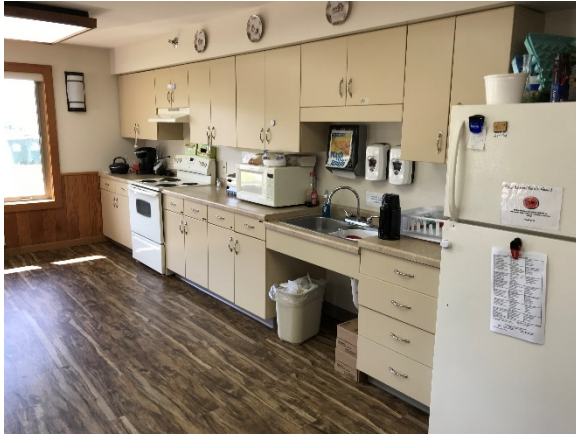
Common kitchen area with food and drink available throughout the day