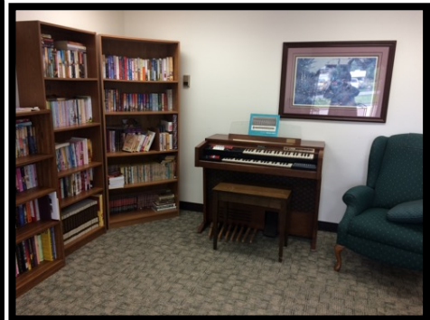
Common sitting area with organ and library