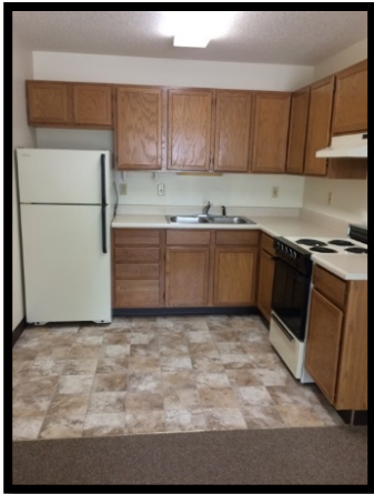
Kitchen in apartment