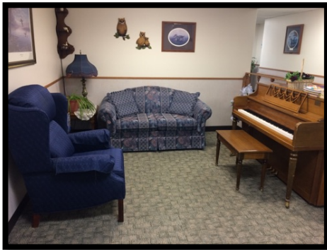
Common sitting area with piano