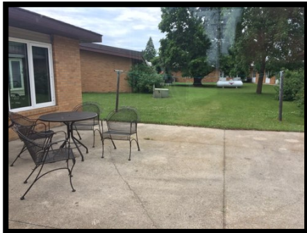
Outdoor courtyard with seating