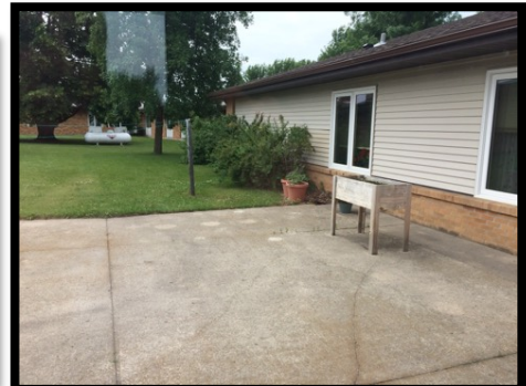
Outdoor courtyard with raised garden box