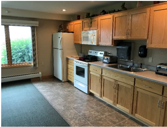
Common area kitchen and snacks