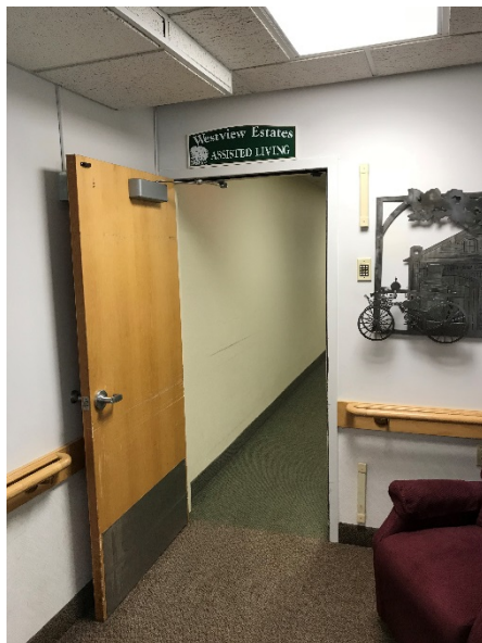
Hallway doorway and signage between setting and nursing facility