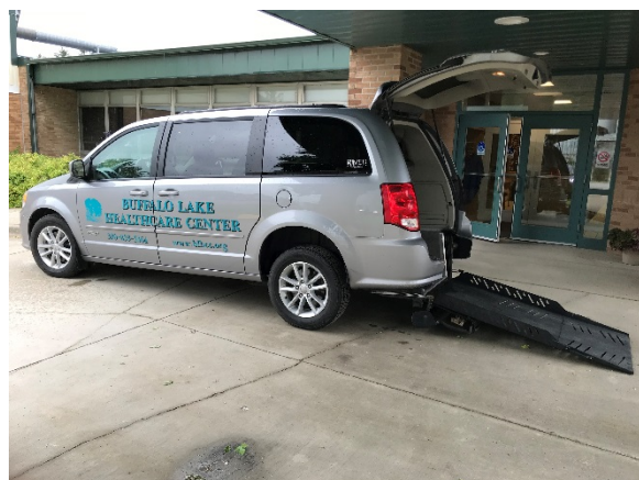
Continuum of care campus van to support people's transportation needs