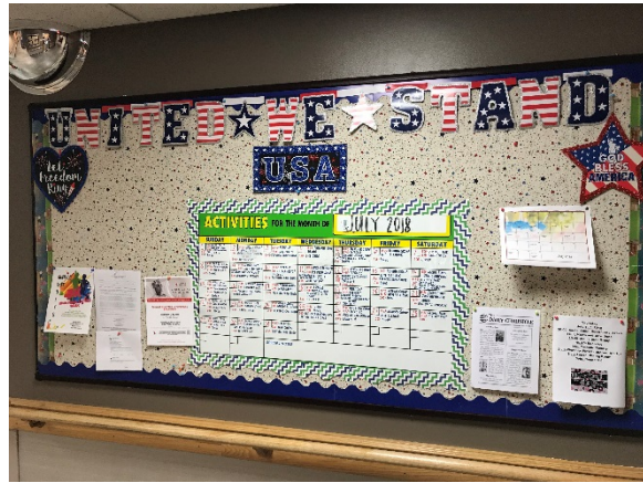
Community activities bulletin board